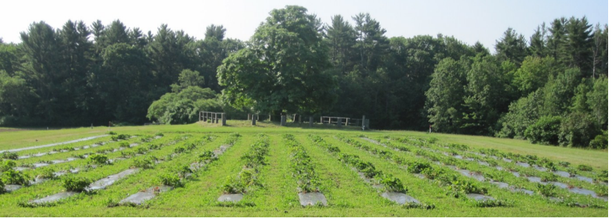
University of New Hampshire strawberry Crop Reference Set, planted October 2010.

So where are these plants now? Approximately 687 strawberry genotypes were planted in the Michigan and Oregon locations in August 2010 (North American propagations) and 127 genotypes representing three European mapping populations (France, The Netherlands, and the UK) in July 2011 (European propagations). In October 2010, 212 genotypes were planted at the New Hampshire location, and over 600 genotypes were planted in California (646) and