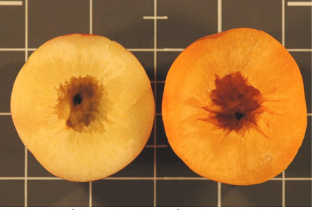
White (left) and yellow-fleshed (right)